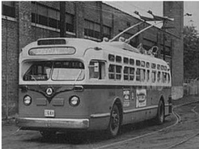
A trackless trolley from Newark is shown in the photo. It operated on electricity and had rubber tires. This trolley could swing closer to the curb to pickup/discharge passengers.