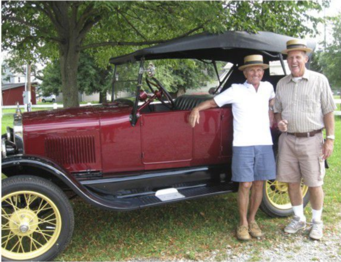
Two retired teachers admire a car driven by their fathers to conferences/meetings