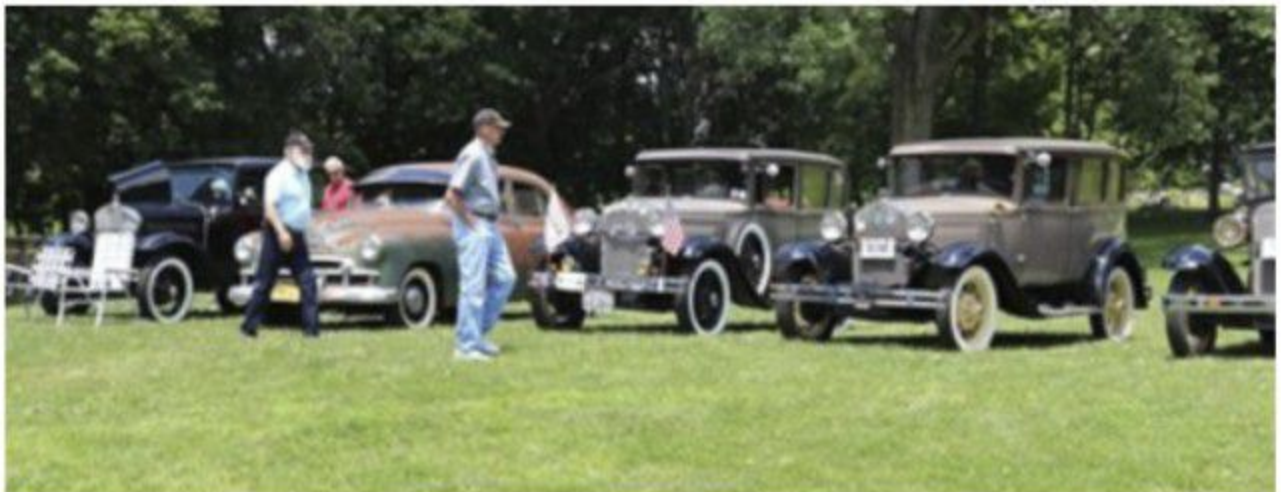
Do you remember any of these cars which were on display at an auto show recently?