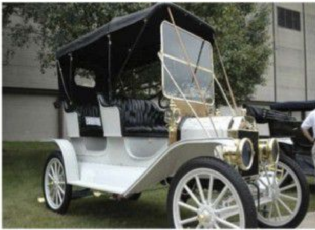
1910 FORD with hand crank to start engine

Shown on the following pages are examples of transportation used by some participants.