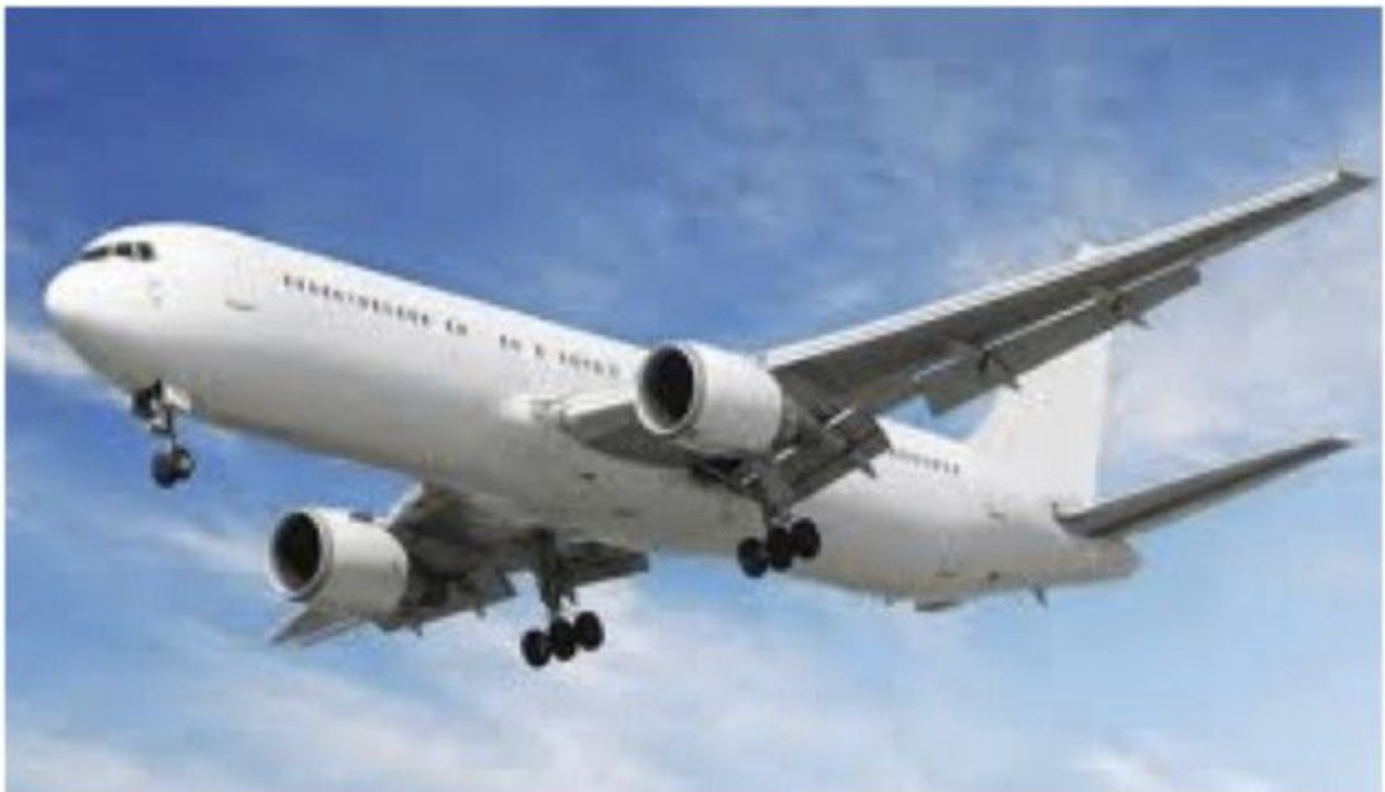
Out of state AMTNJ presenters arriving at Newark International Airport