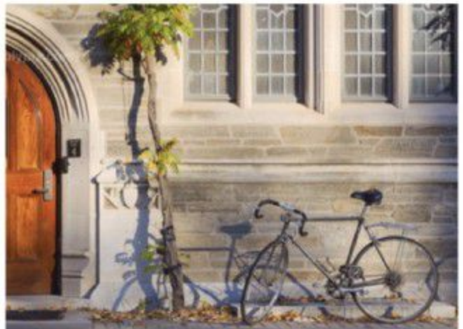
Some people even rode bicycles from nearby