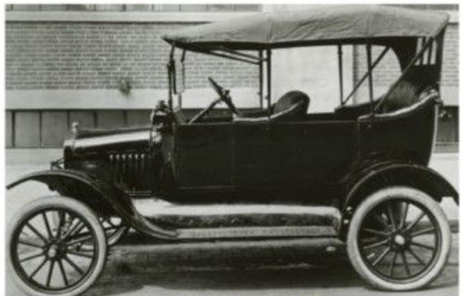
1919 Ford Model T