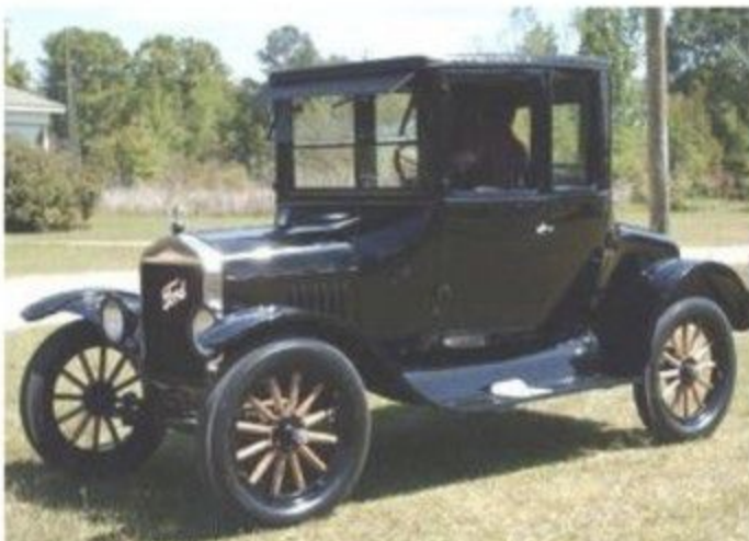
1925 Ford Model T Runabout which cost $250