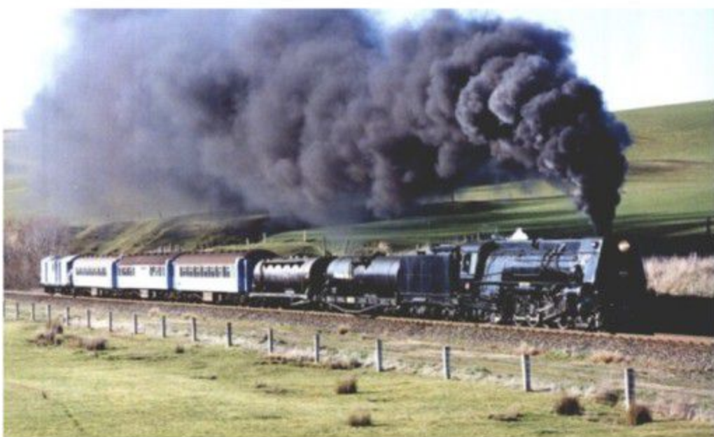
Early Choo-Choo (pew) before modern electric/diesel trains