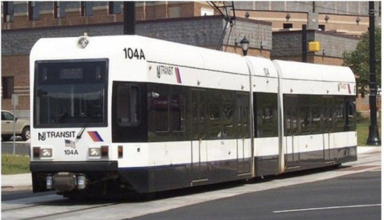
Recent subway/surface transit in Newark, NJ which connects near the Newark train station